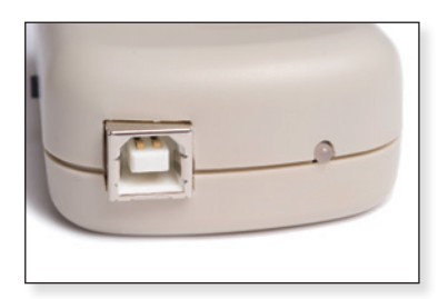
USB-B Connector & Status LED.

USB-B connector for power. The coloured LED indicates switch is in the correct position.